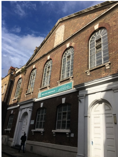
Jamme Masjid/ Brick Lane Mosque